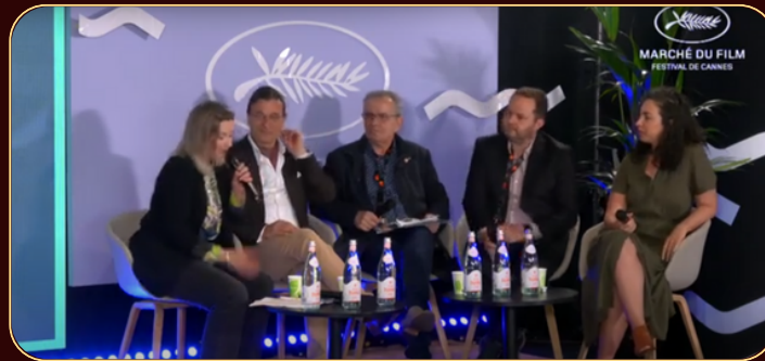
Cannes panel discussion on sustainable creative approach