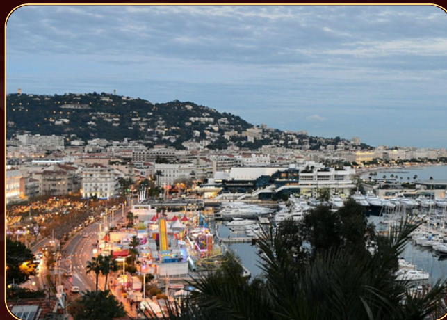
Cannes City, French Riviera

Cannes isn't just a city; it's a living embodiment of cinematic brilliance, celebrity allure, and high-end fashion. Tucked away along the stunning French Riviera, Cannes has evolved far beyond its humble beginnings as a festival venue. It's now the pulsating heart of the film industry's glamor and allure, beckoning filmmakers, celebrities, and movie enthusiasts from every corner of the globe. As the years have passed, this coastal paradise has flourished into a vibrant zone for culture and extravagant festivities. Its impact on tourism and the arts is undeniable, leaving an everlasting imprint on those who visit. From its rich history to its vibrant present and promising future, Cannes epitomizes the enduring enchantment of cinema and the timeless charm of French Riviera living.