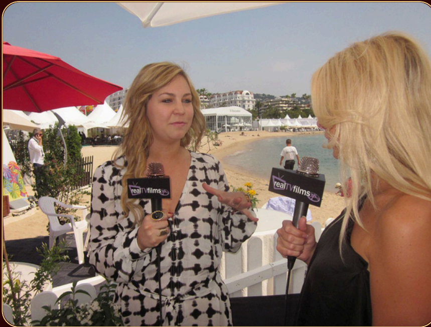
2011 Cannes Film Festival media coverage presenting actress Dana Rosendorff