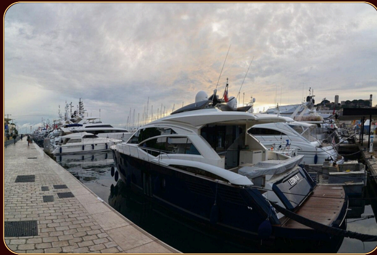
The famous Vieux Port de Cannes for Yachts

Now speaking of challenges one major event was when the pandemic hit Cannes hard, affecting its tourism-dependent economy. The Cannes Film Festival, along with various other events held throughout the year, plays a vital role in driving the city's economy, contributing to approximately 85% of its yearly income generated from visitor expenditures. However, the COVID-19 pandemic inflicted substantial economic damage on Cannes, leading to an estimated loss of nearly $1 billion due to lockdowns and travel restrictions. Numerous businesses, particularly in the tourism and hospitality sectors, depended on government assistance to stay afloat (Roxborough, 2021). However, the festival's return signifies a turning point, with safety measures and vaccination drives ensuring a successful and safe event. Looking ahead from 2021 to 2022, the easing of travel restrictions has sparked a resurgence in luxury rentals and yacht bookings, showcasing Cannes' enduring appeal as a global tourist destination. The Cannes City Hall estimated the total economic impact to reach 196 million euros, highlighting the festival's significance in driving economic activity. The Cannes Film Festival remains a crucial driver of economic activity, attracting high-profile clients and events, and signaling a promising future for the city's tourism and luxury sectors (Luxus, 2022).