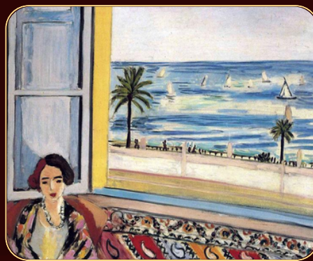
Henri Matisse's painting on the French Riviera- "Seated Woman, Back Turned to the Open Window" (1922)

Also, in context to culture, the impact of the French Riviera and Cannes extends beyond its cosmopolitan allure to influence various artistic and intellectual endeavors. The region's vibrant atmosphere, blending natural beauty with a sophisticated lifestyle, has inspired generations of artists, writers, and filmmakers. The French Riviera's scenic beauty and vibrant ambiance have drawn renowned artists like Picasso, Matisse, and Cocteau, inspiring iconic artworks reflecting the region's cultural essence. Similarly, literary giants like Fitzgerald, Hemingway, and Huxley found creative inspiration amidst the Riviera's tranquil settings, enriching their narratives with themes of luxury, yearning, and societal transformation (Dorota,2017).