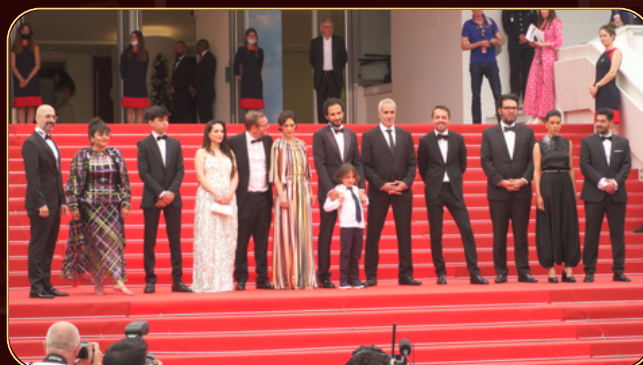
75th Cannes Film Festival red carpet with celebrities