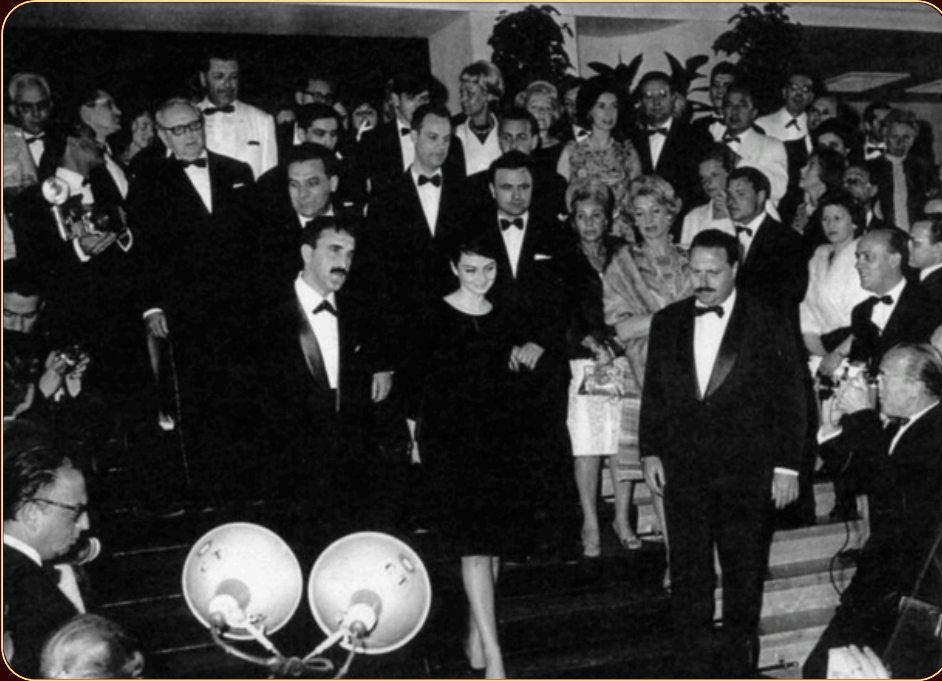
Cannes Film Festival, 1963

When we think of extravagant events like film festivals, do they not only achieve their intended goals but also promote their host cities, or are there potential loopholes and drawbacks that question their true benefits? Film festivals are known to bring a wave of positive impacts on their host cities. The Cannes Film Festival is not just a celebration of cinema but also a financial engine, bringing in a staggering USD 33 million per day over its two-week span. This revenue streams from various sources, including support from bodies like the Ministry of Culture's National Cinema Centre and the Provence regional government, market fees at the Cannes Film Market, attendee payments, sponsorships, TV rights, and the substantial uptick in tourism it triggers in Cannes. This economic boost profoundly impacts the city, fueling its economy as media coverage boosts Cannes' visibility as a premier destination. The festival's inclusion of international filmmakers, production companies, and industry stakeholders fosters networking and business prospects for local businesses as well. However, with this excitement comes challenges like heightened traffic, congestion, and temporary disruptions to locals' daily routines, highlighting the importance of managing these aspects effectively to ensure a harmonious balance between economic prosperity and city life (Jackson, 2023).