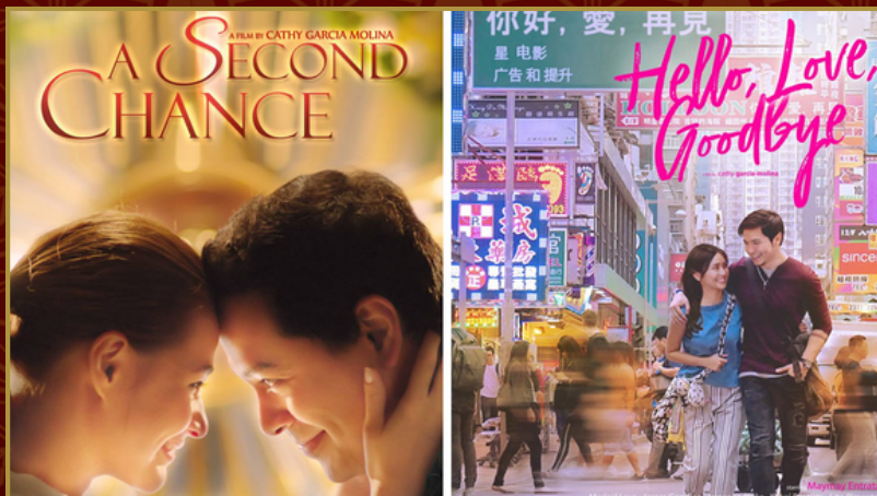
High-grossing Romance Filipino films - Rewind (2023); A Second Chance (2015); and Hello, Love, Goodbye (2019)