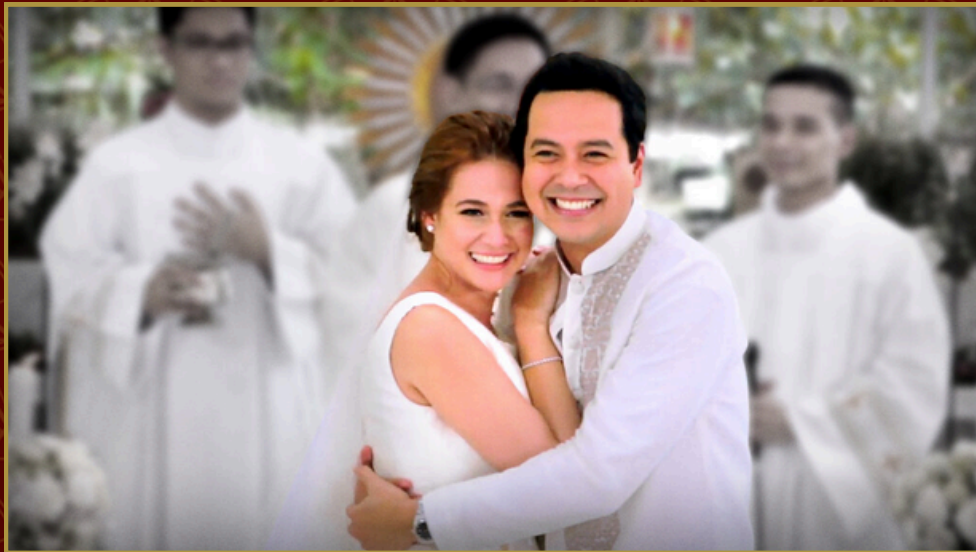
A Second Chance (2015)

The cinema of the Philippines is a vibrant extravaganza of life, filled with themes of drama, love, enthusiasm, and stories. The Filipino film industry is one of the most blooming cinemas in Southeast Asia. However, the native film industry has catapulted its international presence and collections in the recent decade with the use of one specific genre - 'romantic drama'. Among the highest-grossing films of all time in the Philippines, the three domestic films are considered iconic by Filipino audiences. The films are Rewind (2023); Hello, Love, Goodbye (2019); and The Hows of Us (2018). Intriguingly, all three films come under the genre of romantic comedy, or sentimental romance. The films performed at par with blockbuster Hollywood films such as Avengers: Endgame , and Frozen II . The most successful domestic Filipino films emphasize aspects of affection or a fantasy of love. For example, romance fantasy Rewind earned 1.2 billion Philippine pesos in the domestic market. Let's dive into some of the highest-grossing Filipino films that won over audiences through their fascinating narratives on 'love'.