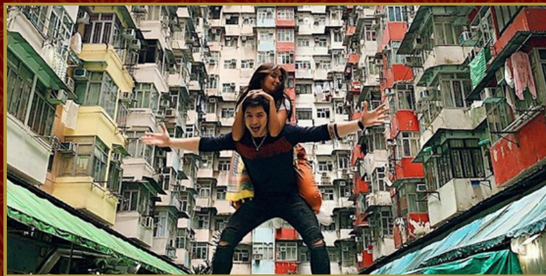
Hello, Love, Goodbye (2019)

A Second Chance (2015) was a special film in the journey of popularization and demand of this genre among domestic audiences. Directed by the prominent Filipino screen director of ABS-CBN, Cathy Garcia-Molina, the film narrates the intricacies of a married life with a promise of a 'fragile forever'. However, the protagonists triumph in their love story at the end. This film inspired many consequent romantic films in the Philippines with sentimental storytelling and acted as a strong starting point. The film touched the mark of 500 million Philippines pesos and became the sixth highest-grossing film of all time.