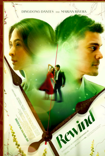
The Hows of Us (2018), and Rewind (2023)