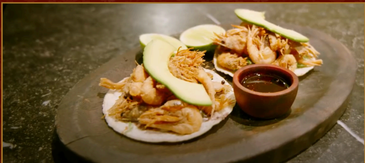
Presentation of beautiful culinary dishes from the documentary 'A Tale of Two Kitchens' (2019)

The most interesting part is that they have a unique hiring practice at Cala, established in 2015. It will amaze you when you watch the restaurants' dedication to giving second chances to people with criminal records. This unconventional way with a family-like environment in both kitchens highlights the positive effects of their inclusive approach. To make it more authentic, it includes personal views, for example, Employees like Orlando Castillo, and Johnny Robles share how the restaurant's supportive culture helped them reintegrate into society. This documentary will show you how the often-overlooked narratives of restaurant workers, focusing on their personal growth, camaraderie, and the unique challenges they face within their cultural contexts.