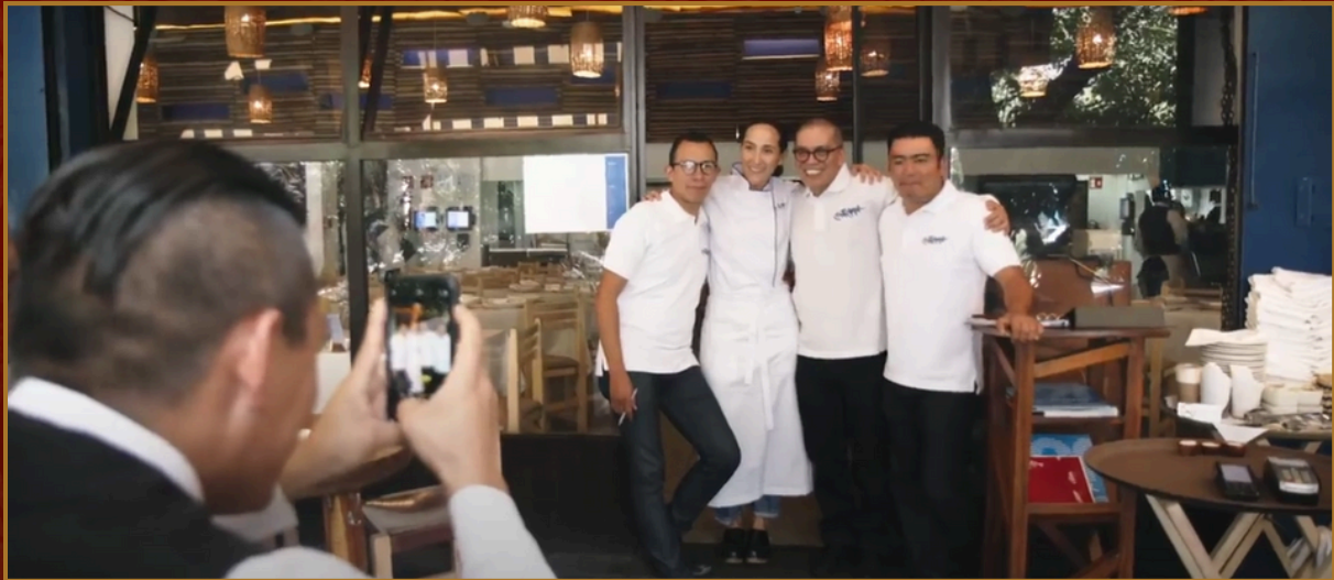
Mexican chef Gabriela Cámara posing with her staff members

Intimate moments were shown through shots of staff preparing meals and interacting with customers, celebrating the artistry of Mexican cuisine and the personal journeys of the employees. The blend of personal stories with beautiful shots of Mexican dishes being prepared helped viewers to resonate closely.