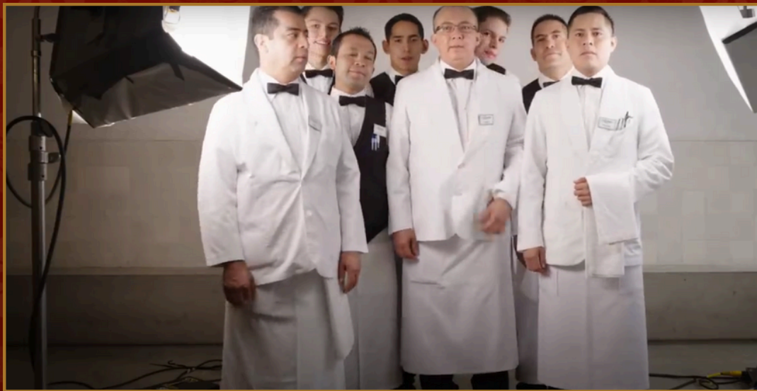
Mexican restaurant Contramar's staff

Food and cinema can often make an interesting combination, especially for a place that is known for both. And yes, it's Mexico! Mexican food and films both awe us and here comes a 2019 documentary film on culinary directed by Trisha Ziff, titled ' A Tale of Two Kitchens '.