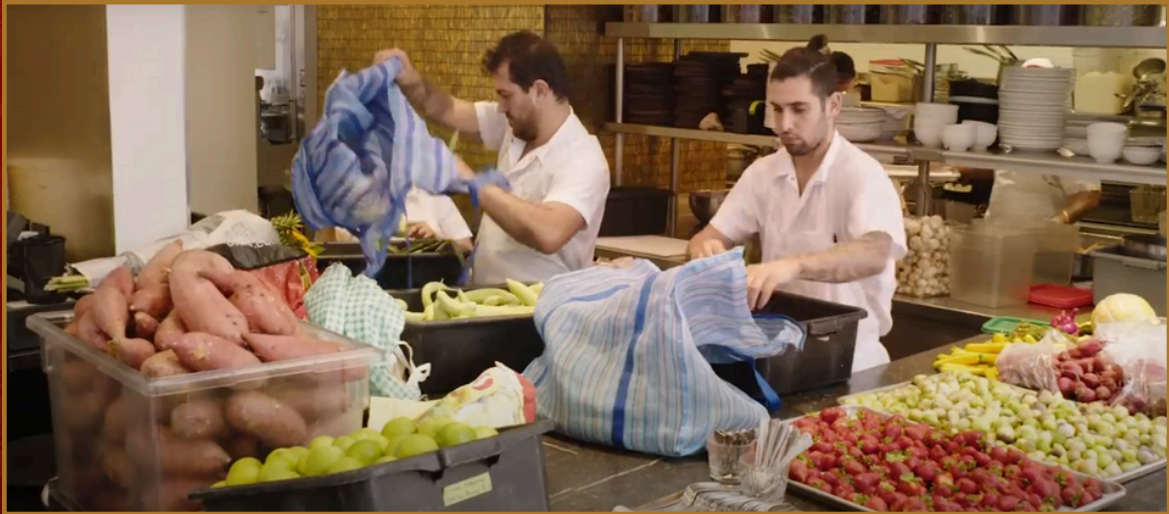
A scene showing cooking preparations